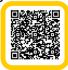
Clinical Study Booklet