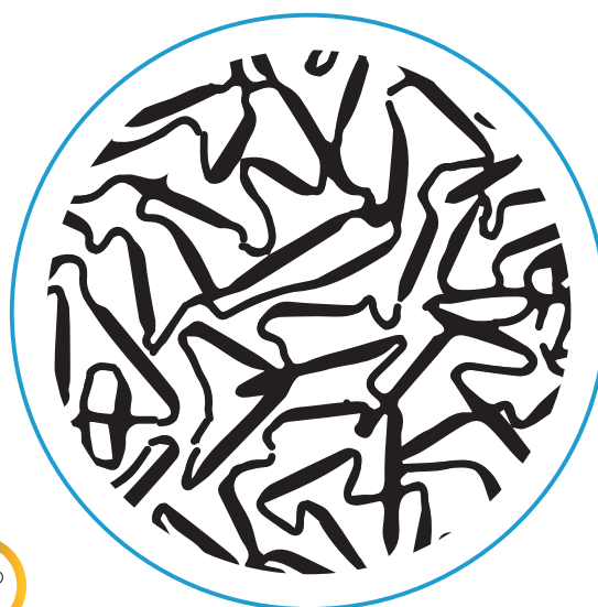
Soft material at body temperature